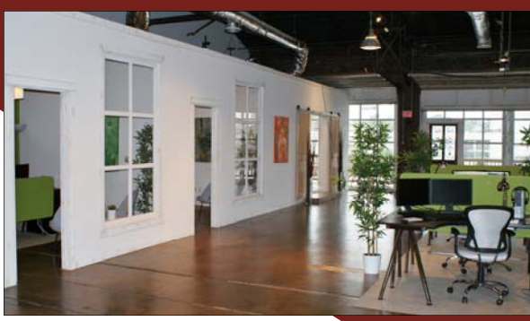
996 Huff Road, Suite D, Atlanta, GA 30318